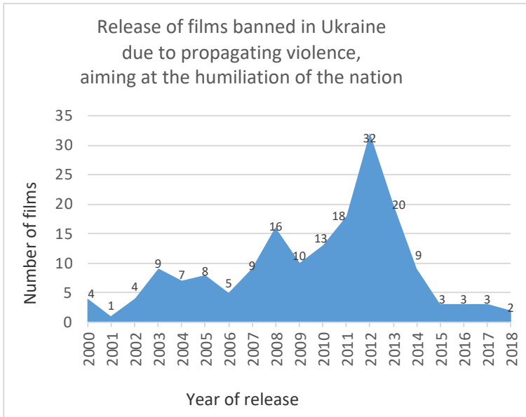
Chart 1. Release of films banned in Ukraine due to propagating violence, aiming at the humiliation of the nation.