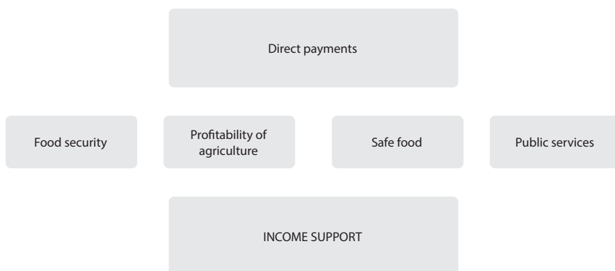
Figure 2. Objectives and methods of direct payments under the European Union's Common Agricultural Policy